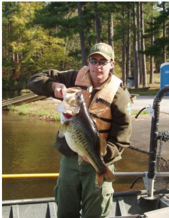
A 16-pound 15 ounce Florida largemouth bass that was collected by electrofishing (and released alive) in Brown's Creek lake in October 2009

In the mid-1980s, TWRA contracted with Tennessee Technological University (TTU) to conduct a statewide evaluation of reservoirs in an effort to determine Florida largemouth bass influence in Tennessee waters. TTU found that there was a slight presence of the Florida gene in many reservoirs. This may have been attributed to escapement from private ponds that may have been stocked with Florida bass in the past. Another theory is that some reservoirs in Tennessee are in a natural intergrade zone where there is overlap between northern and Florida largemouth bass genes.